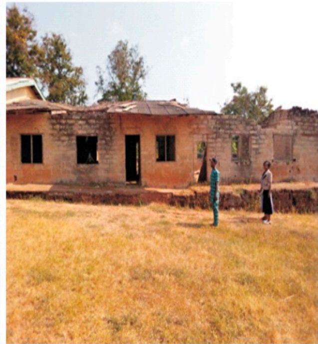
Dilapidated Primary School Classrooms in Ijirin