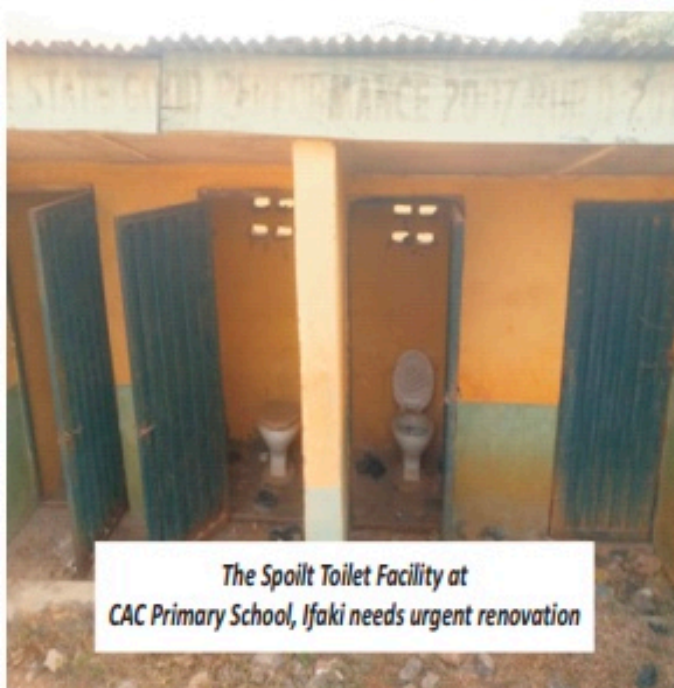
The Spoilt Toilet Facility at CAC Primary School, Ifaki needs urgent renovation