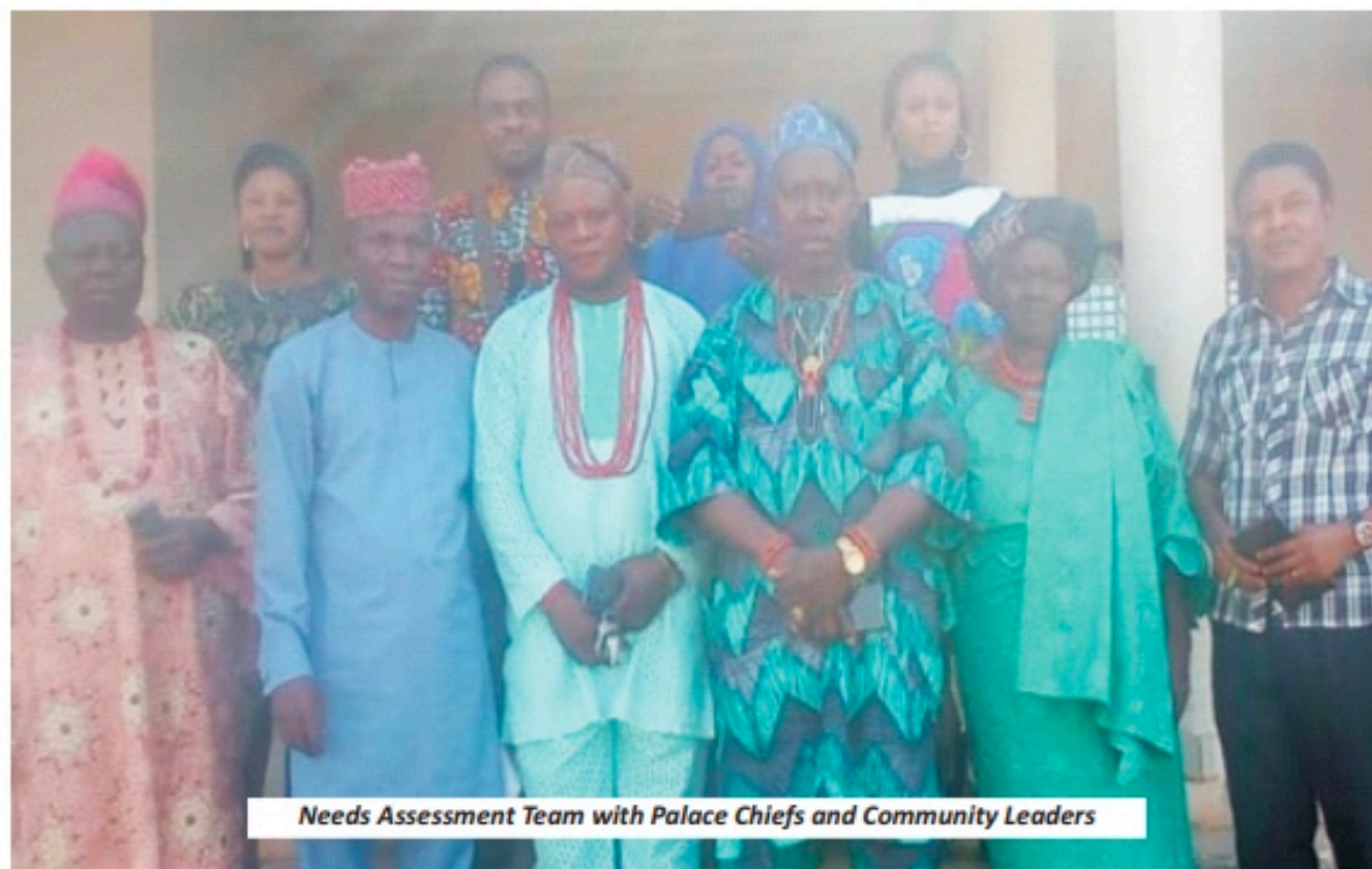
Needs Assessment Team with Palace Chiefs and Community Leaders

The LGA team also visited health facilities and schools to ascertain the conditions of the facilities. A Validation Workshop was organised to review the needs collected by the Needs Assessment Team. Present at the workshop were representatives of State Ministries, Departments, and Agencies, as well as the Community Needs Assessment Team.