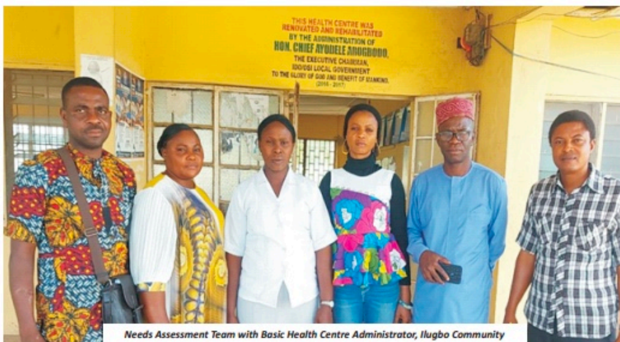
Needs Assessment Team with Basic Health Centre Administrator, Ilogbo Community