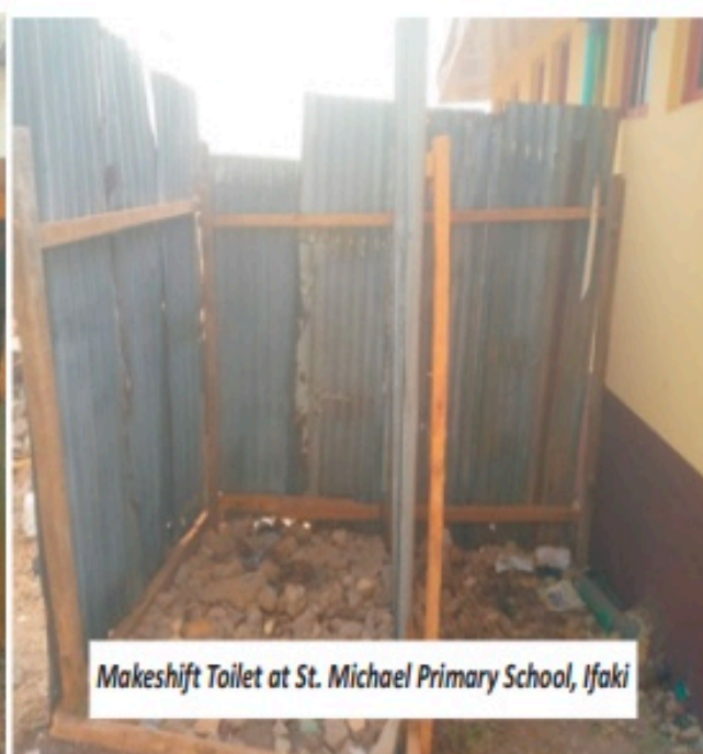
Makeshift Toilet at St. Michael Primary School, Ifaki