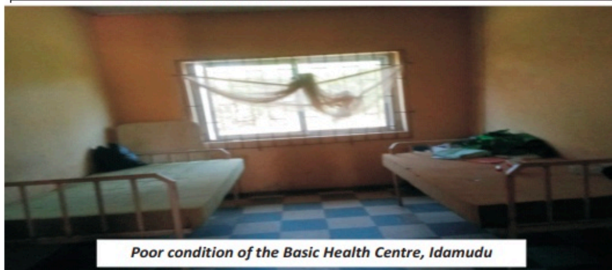
Poor condition of the Basic Health Centre, Idamudu