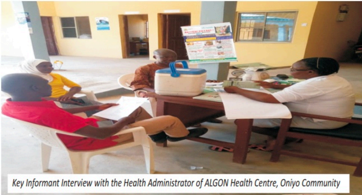
Key Informant Interview with the Health Administrator of ALGON Health Centre, Oniyo Community