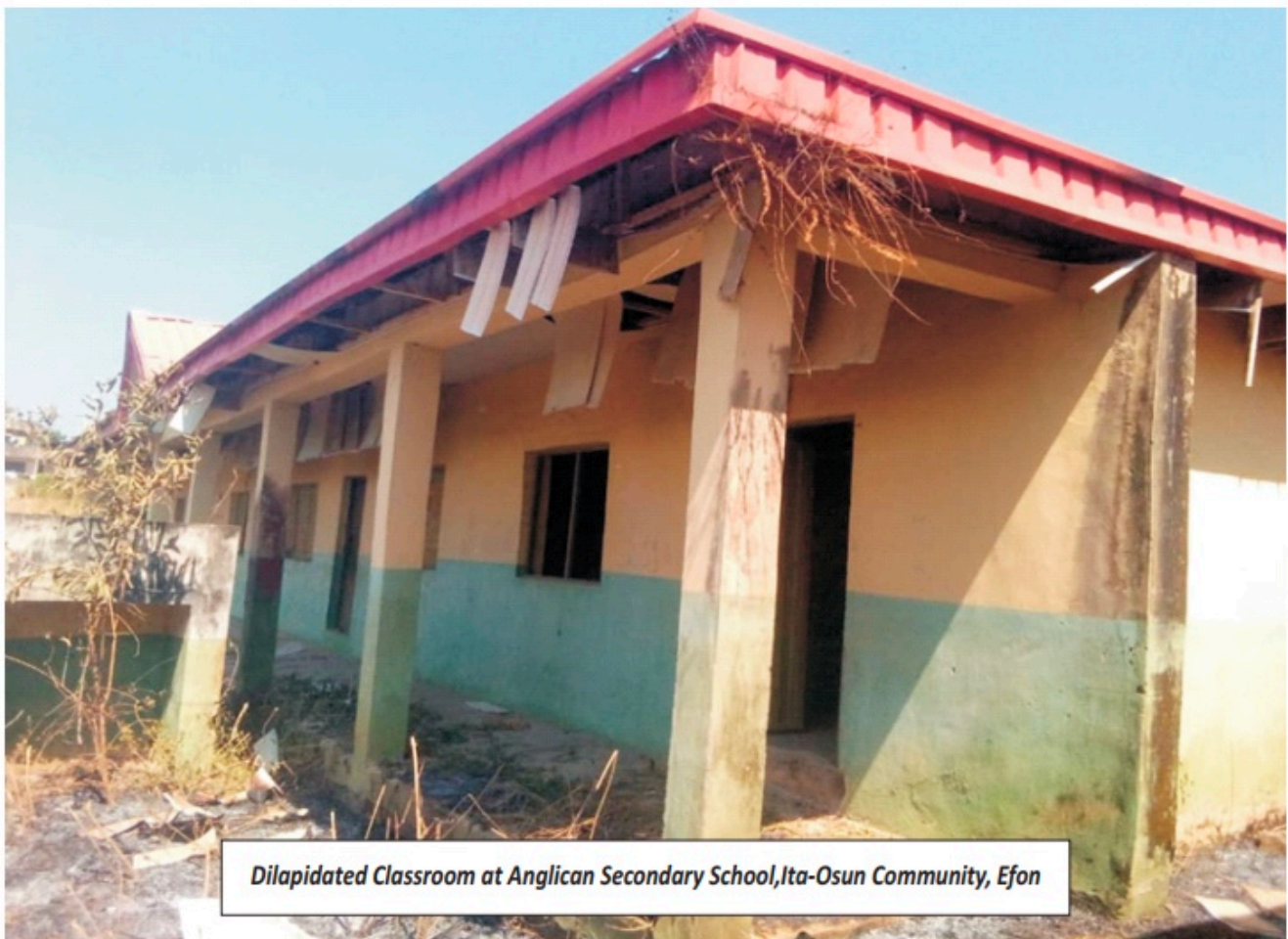
Dilapidated Classroom at Anglican Secondary School, Ita-Osun Community, Efon