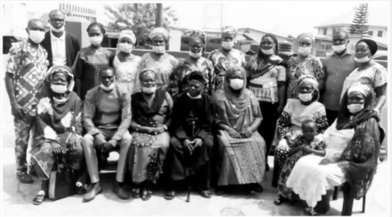
Needs Assessment Team Members with Women Leaders of Iyin Community, Irepodun-Ifelodun