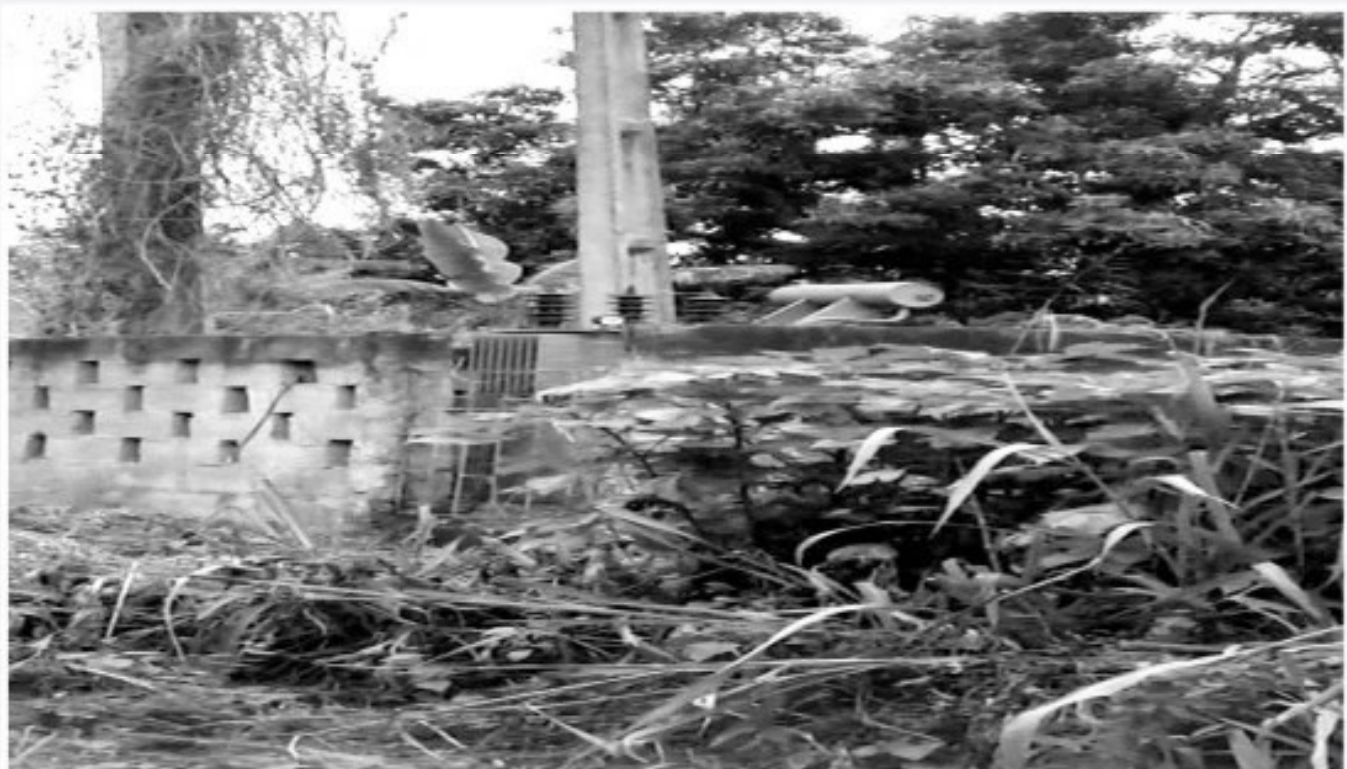
The transformer at Igrigiri has not been working for the past 30 years.