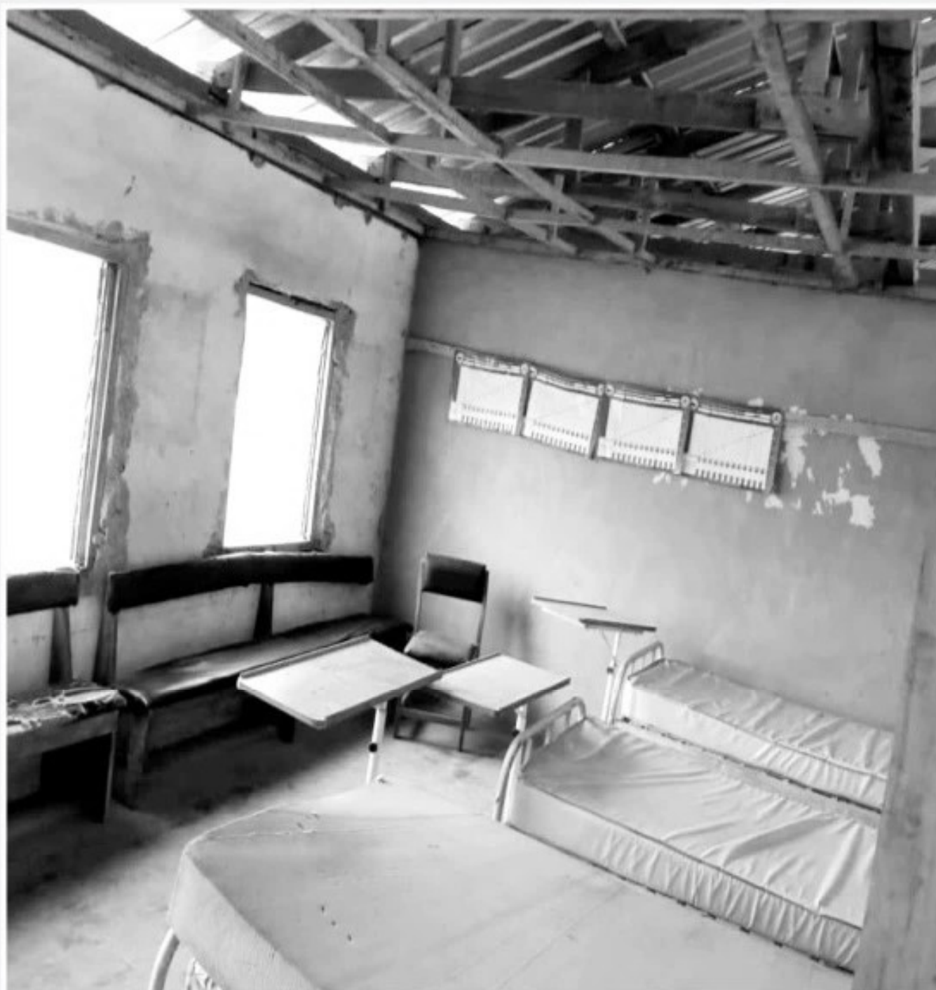
Abandoned Basic Health Centre at Ikun-Oba Ekiti