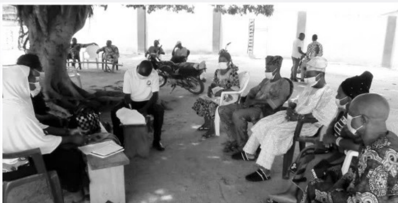
Focus Group Discussion with Community Leaders, Ise Ekiti.