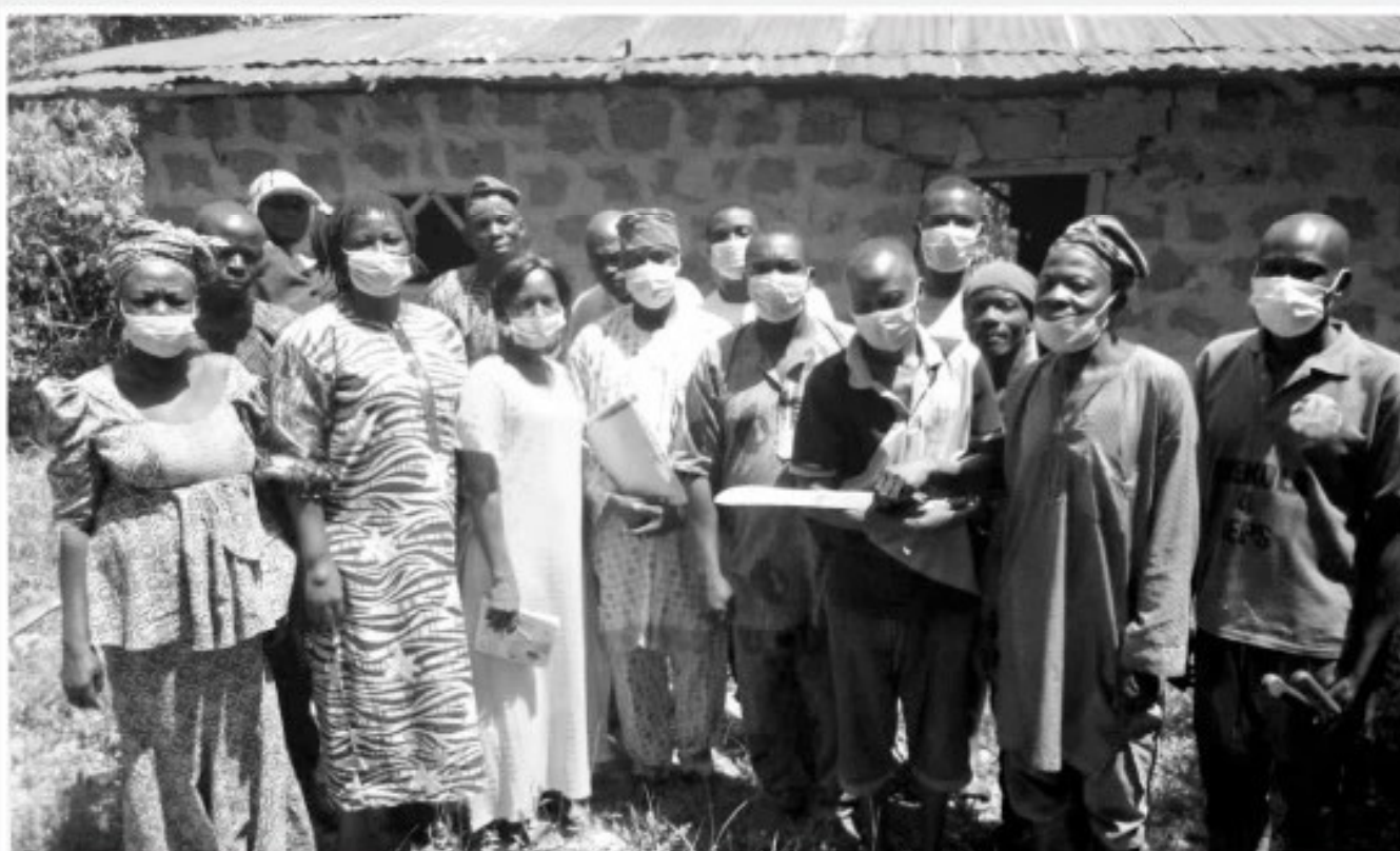
Needs Assessment Team with Representatives of Egan-Aarin, Morupa, Opolopogun and Ipaso communities, Orun Ekiti