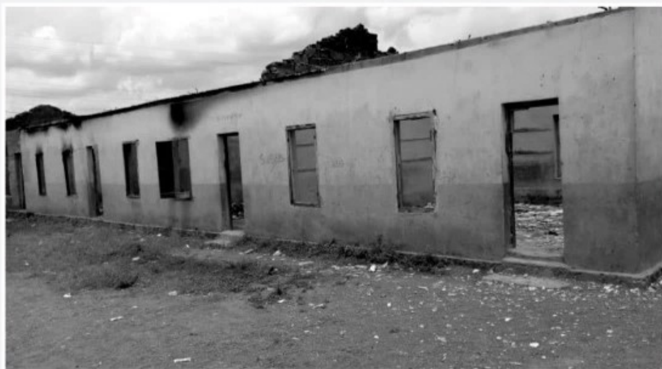
Blown off roof at St. Fidelis Catholic Nursery and Primary School Ojido, Ijigbo, Oke Ewi