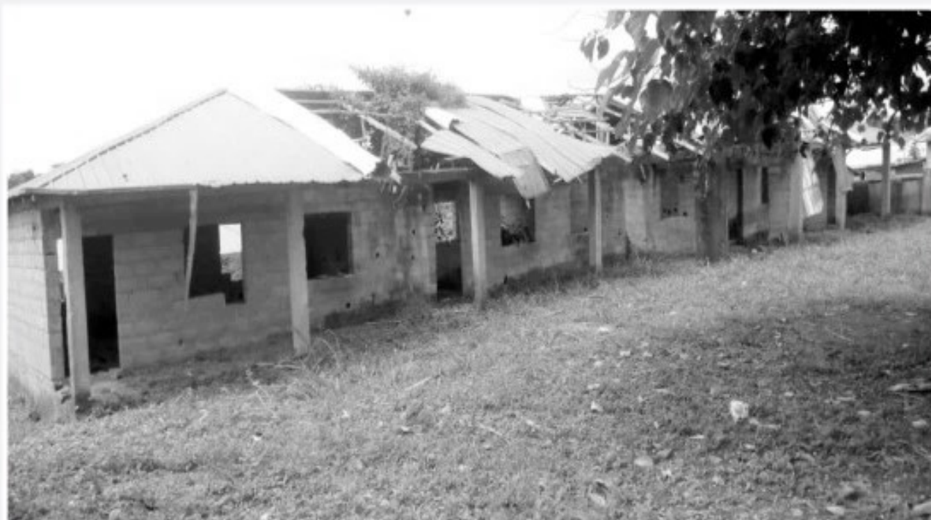
Dilapidated classroom at L.A. Nursery and Primary School, Odo via Ado Ekiti