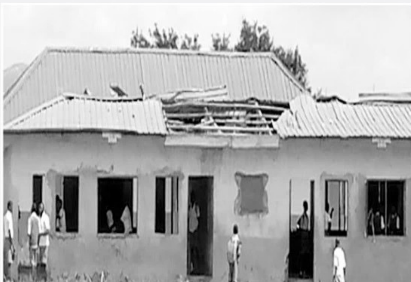
Blown off roof at A.U.D Secondary School Ojido (Oke Ewi) Ado Ekiti