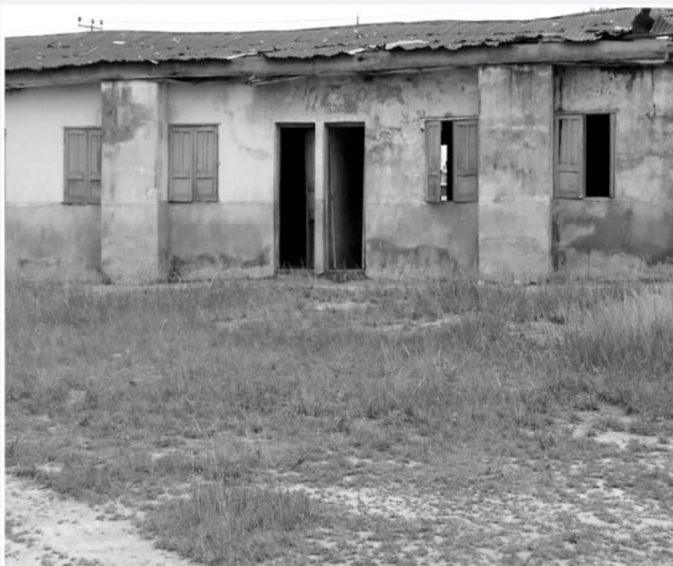
Dilapidated block of classroom at St. Luke's Nursery and Primary School II, Ikun-Araromi, Oke Ekiti