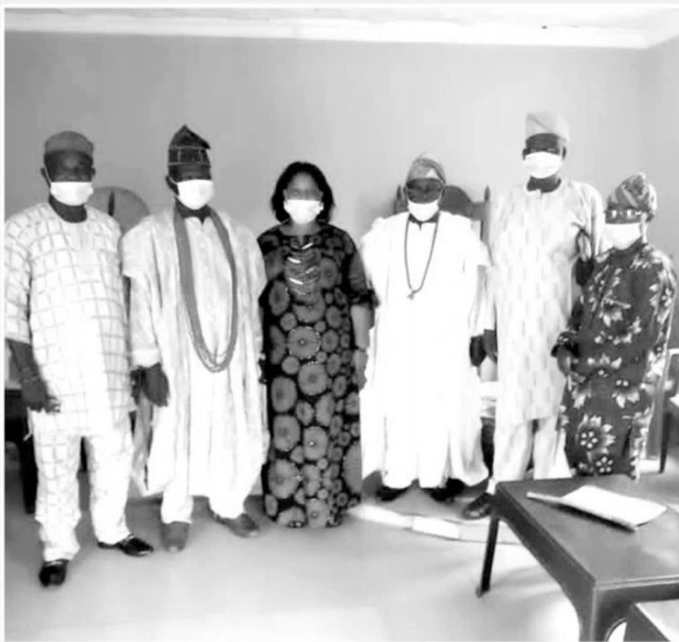
Needs Assessment Team Members and Chiefs at Akodi Idofin, Ojido Area, Odo-Ado