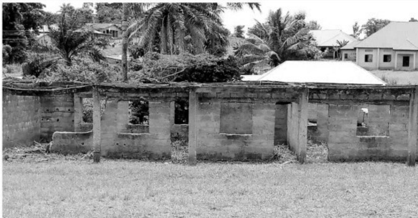
Uncompleted School Block at St Philip's Catholic Nursery and Primary School, Esure Ekiti