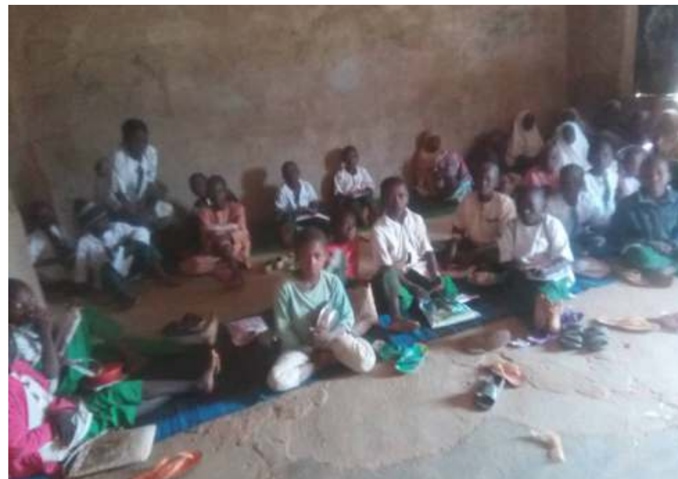
LGEA Primary School, Kankanki, Ikara LGA. Pupils sitting on the floor without reading tables and chairs.