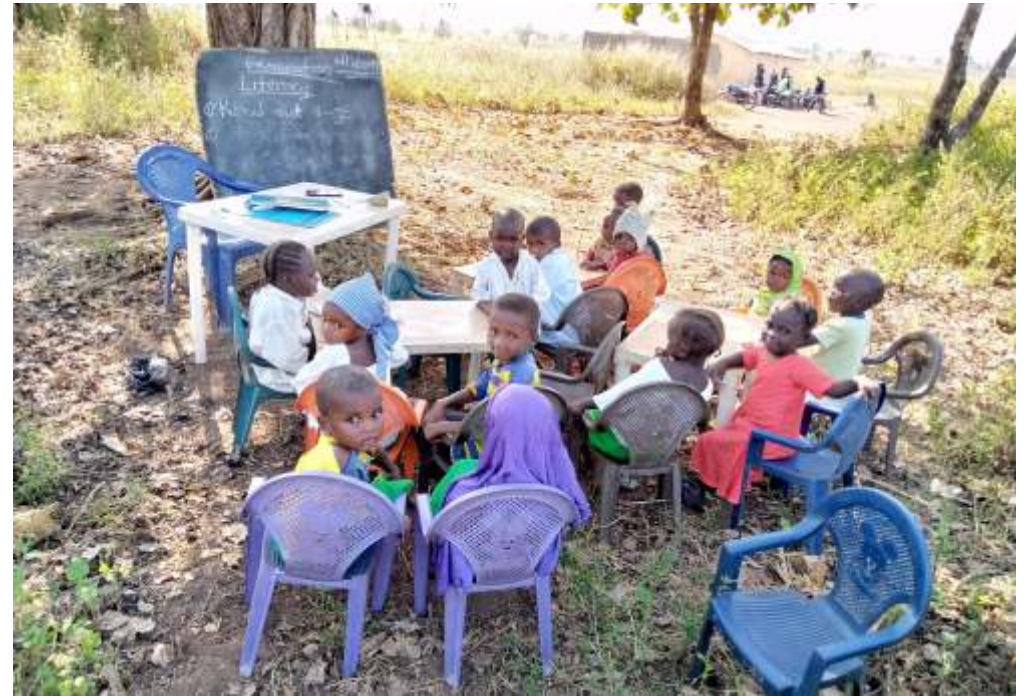
UBE Primary School, Mohanga, Fadan Karshi, Sanga LGA. Pupils learn under a tree.