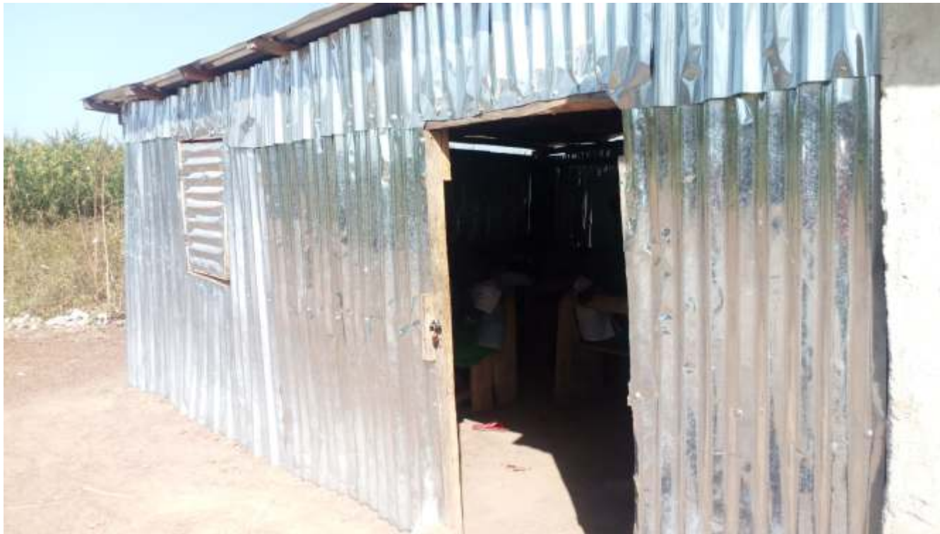
Nomadic Primary School, Unguwar Ganye, Sanga LGA. Classroom built with roofing zinc sheet. Not conducive for learning