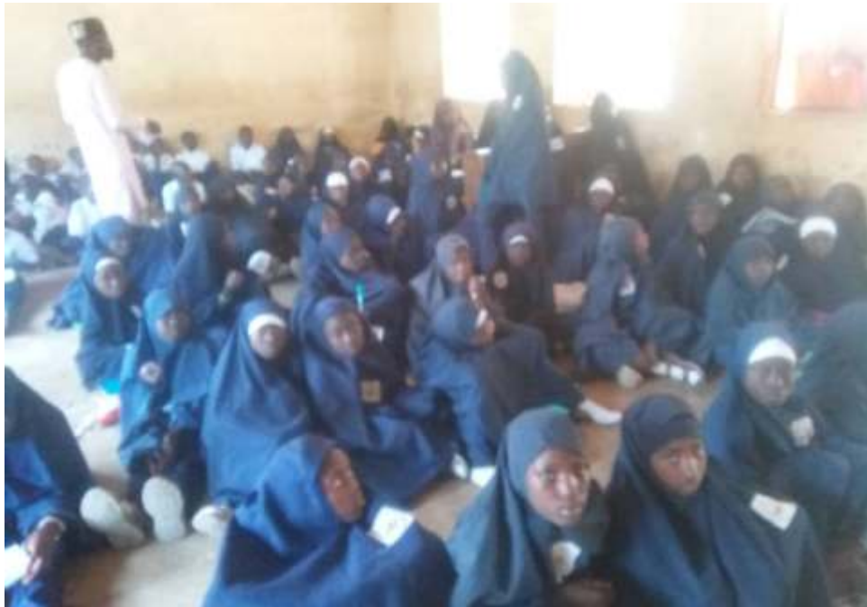
Government Junior Secondary School, Ikara, Ikara LGA. Students sit on the floor without reading tables and chairs.