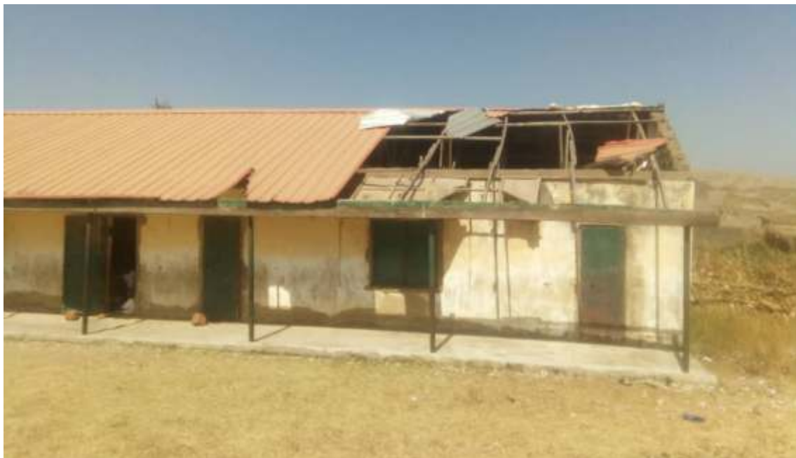
Abdullahi Adamu Model School, Ikara, Ikara LGA. The roof of a classroom blown off by the wind.