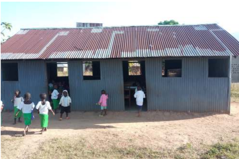
LGEA Primary School, Nandu B, Sanga LGA. Classroom made from roofing zinc. Not conducive for learning.