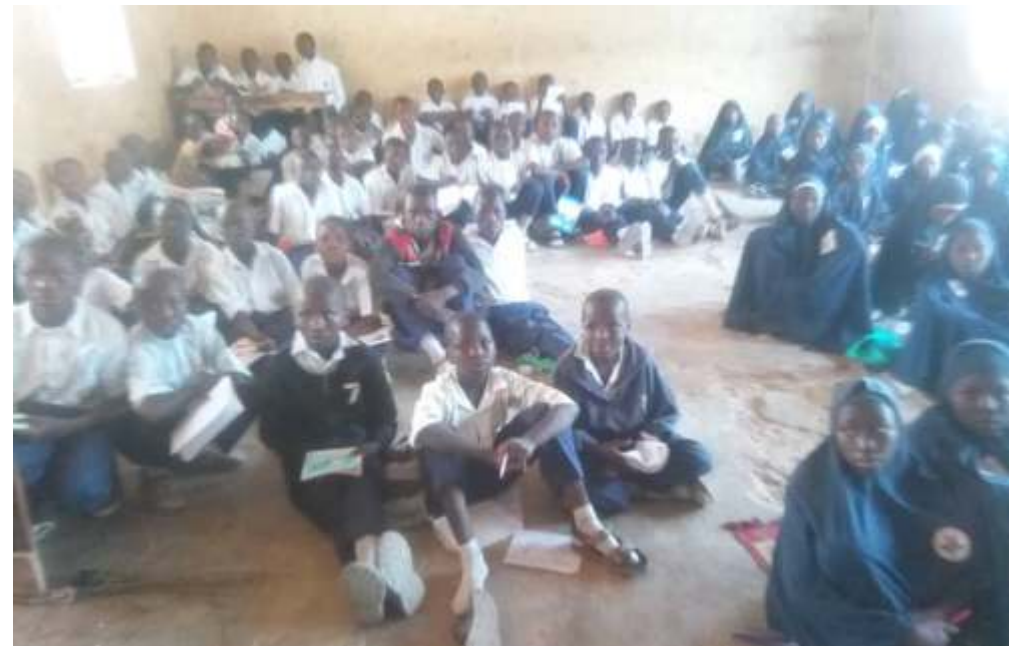
Government Junior Secondary School, Auchan, Ikara LGA. Students sit on the floor without reading tables and chairs.