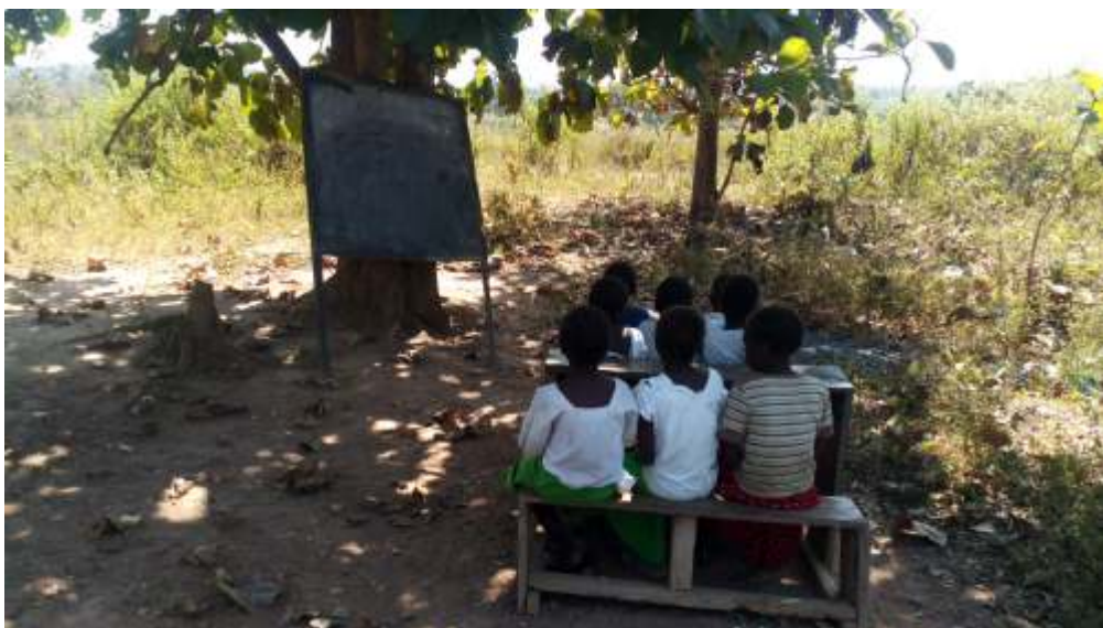
UBE Primary School, Unguwan Galadima, Sanga LGA. Pupils learn under a tree.