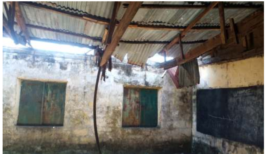
LGEA Primary School, Abari. Dilapidated classroom with falling roof.