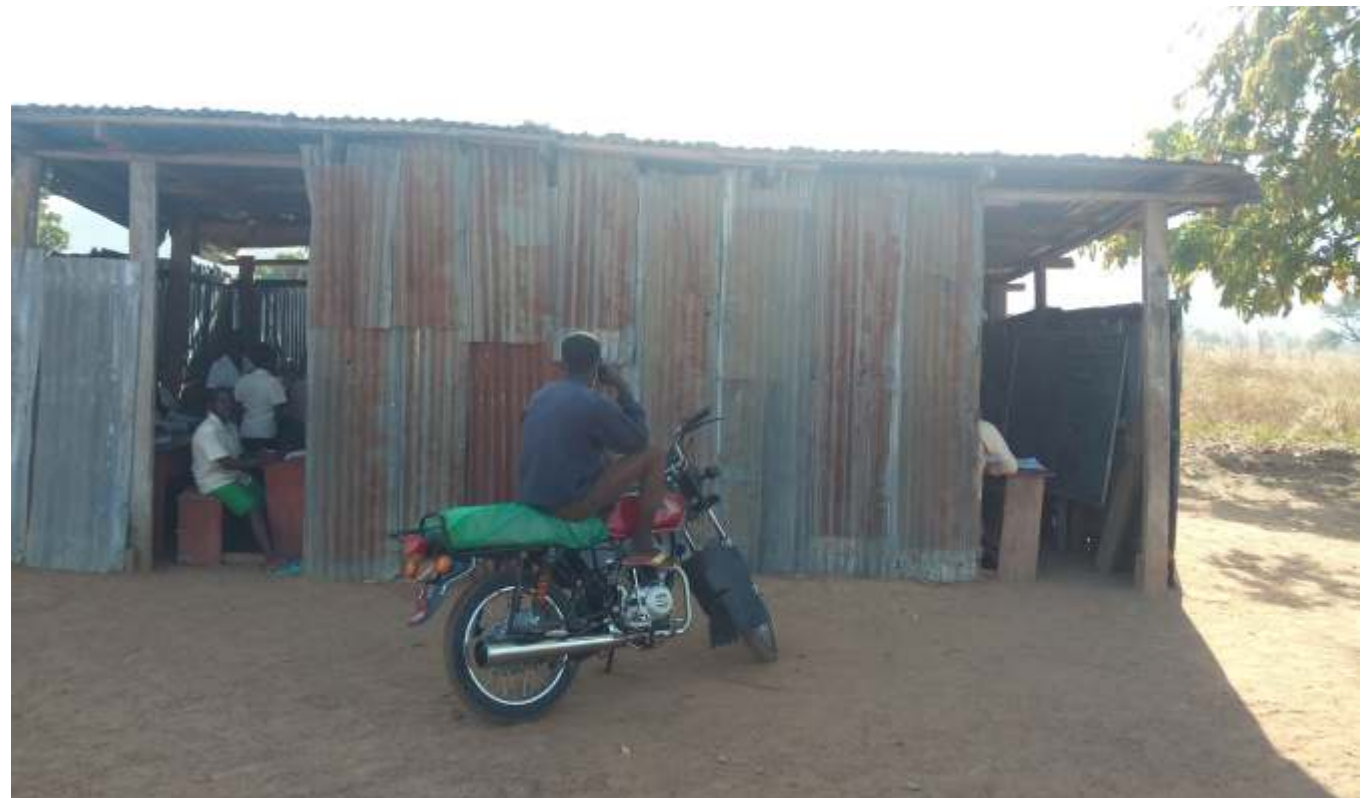
LGEA Primary School, Ningon, Sanga LGA. A classroom made of roofing zinc