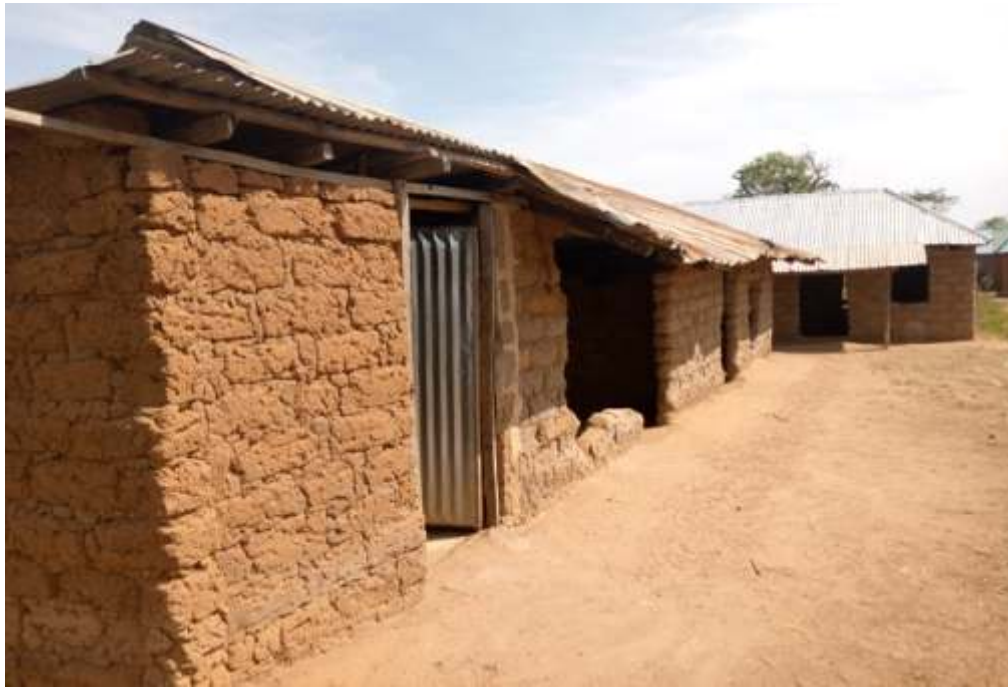
UBE Primary School, Akwa. Block of classrooms.