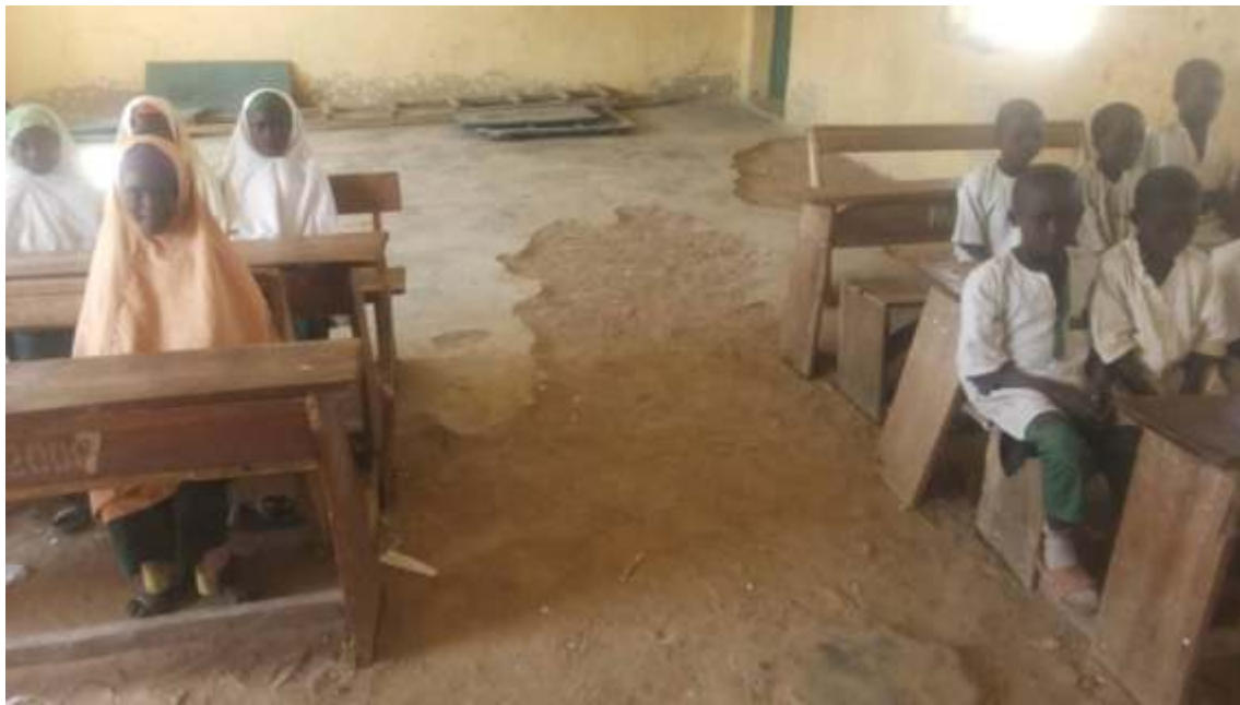
Ikara LGA - LGEA Primary School, KwaKwa, Ikara LGA. The floor of the classroom is broken. Dangerous to the pupils' health