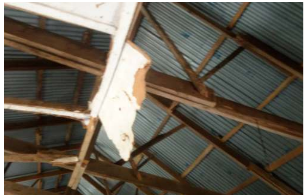
LGEA Anguwar Primary School, Anguwar Mukaddas, Ikara LGA. The classroom ceiling board is dilapidated..