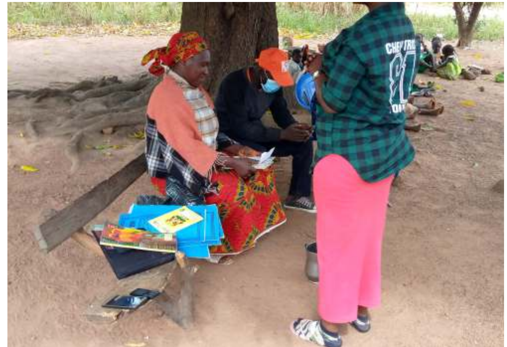
UBE Primary School, Ankirin, Sanga LGA. This is the Head Master's office under a tree.