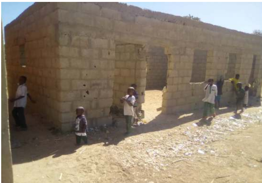
LGEA Primary School, Mafera, Tudun Labi Kwari, Ikara LGA. Un-completed classrooms building.