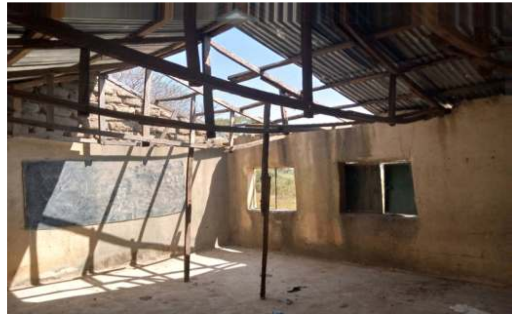
UBE Primary School, Wasa North. Classroom with roof blown off.