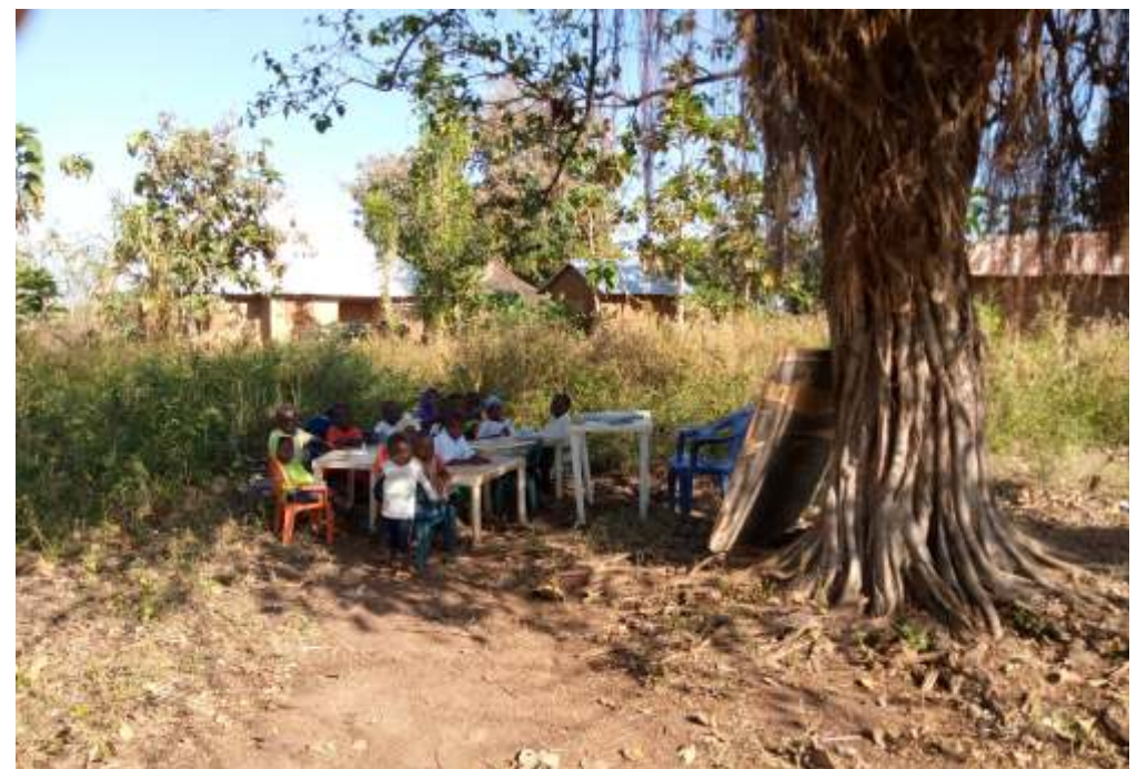
UBE Primary school, Mohanga, Fadan Karshi, Sanga LGA. Pupils learn under a tree.