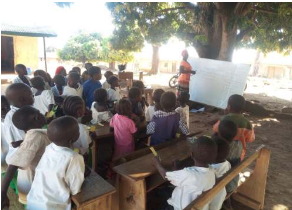
LGEA Primary School, Nandu B, Sanga LGA. Pupils learning under a tree.