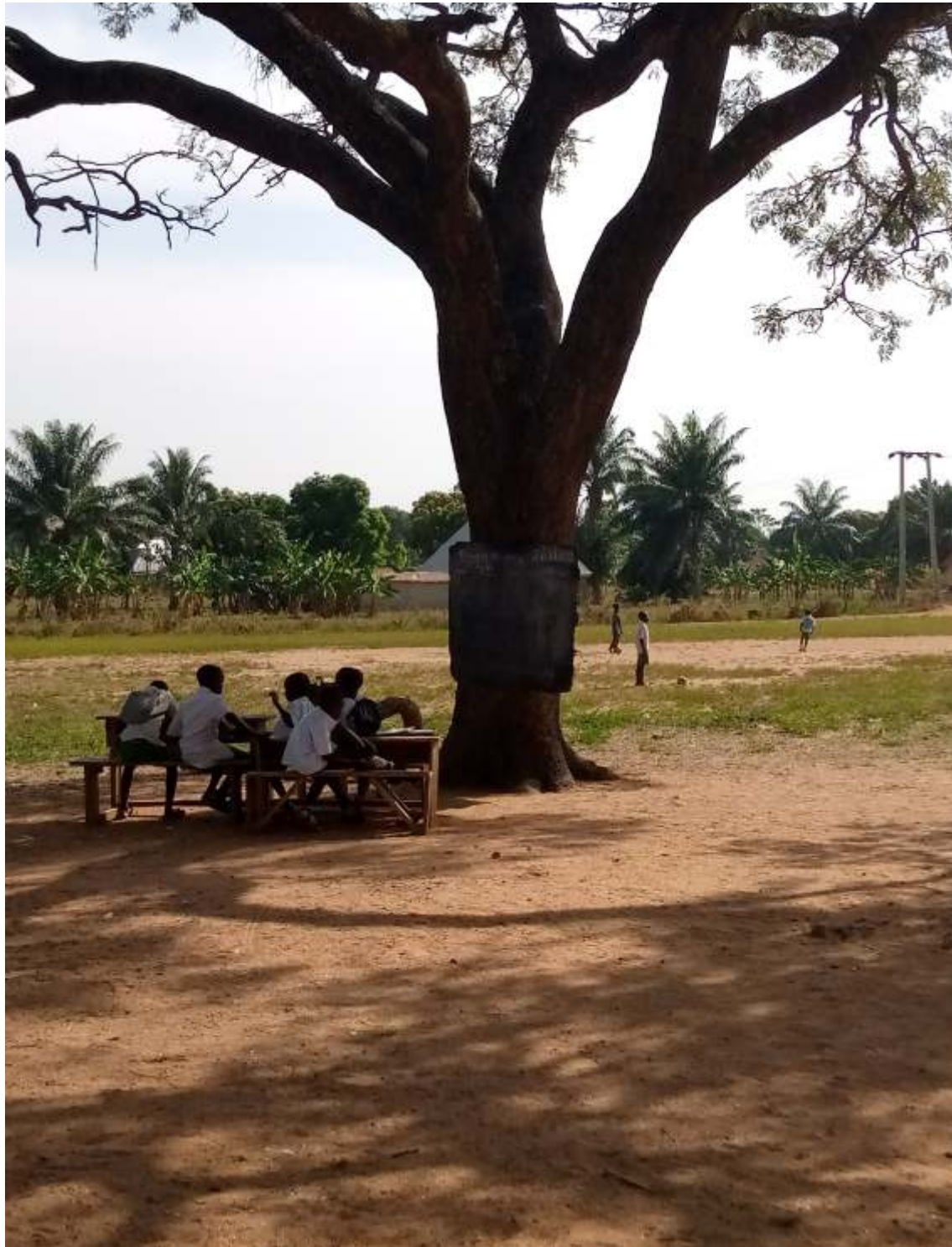
LGEA Primary School, Tsauni, Sanga LGA. Pupils learn under a tree due to absence of classrooms.