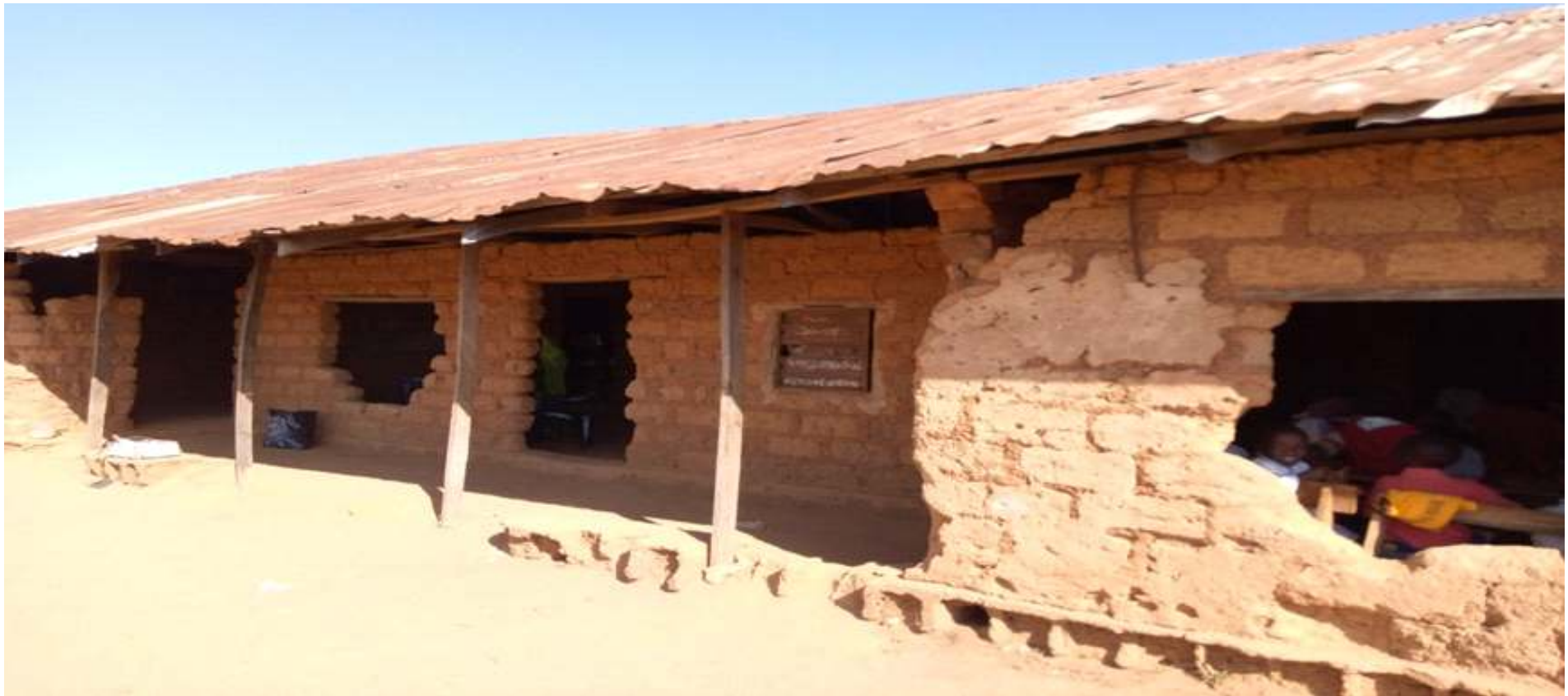
UBE Primary School, Kyamiyah Fadan Karshi. Dilapidated block of classrooms with pupils inside.