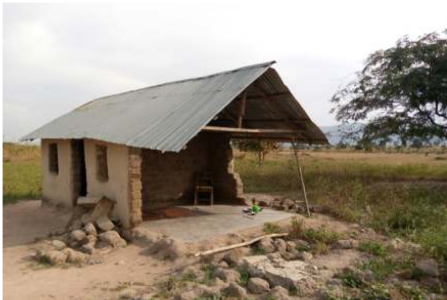
UBE Primary School Unguwar Bera. Dilapidated block of classrooms.