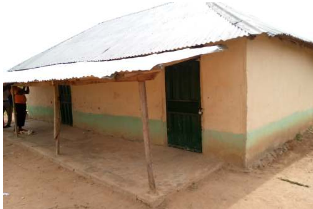
UBE Primary School, Anguwan Magaji, Sanga LGA. This is the only structure in the school. Other pupils learn under the tree.