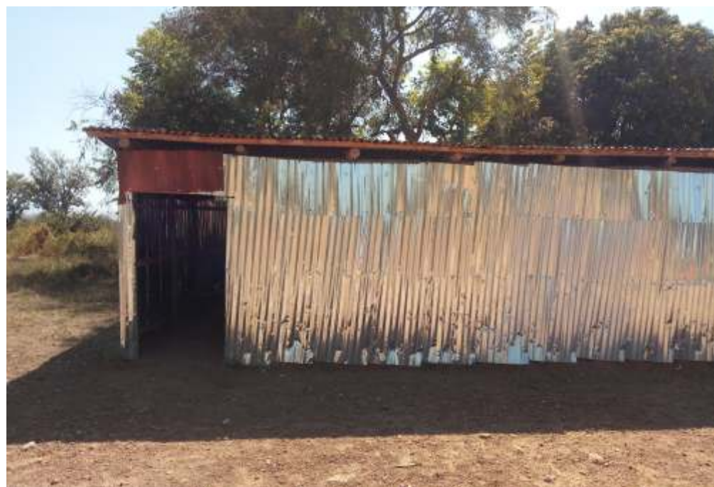
LGEA Primary School, Kobin, Sanga LGA. Classroom built with roofing zinc sheet. Not conducive for learning