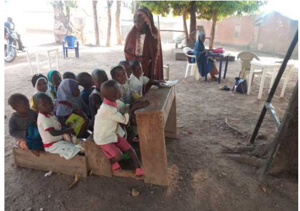
Integrated Quaranic Primary School, Gwantu, Sanga LGA. Pupils learn under a tree.