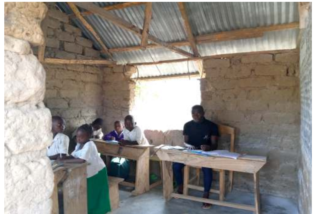
UBE Primary School, Unguwar Bera, Sanga LGA. A classroom without windows or doors.