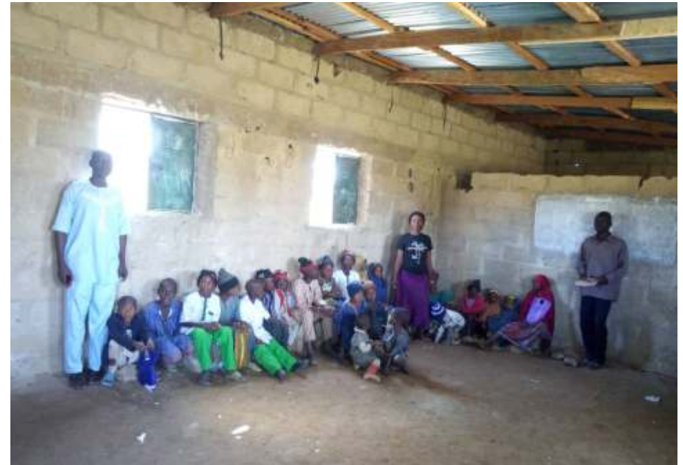
LGEA Primary School, Anguwar Gani, Ikara LGA. Pupils sit on the floor without reading tables and chairs.