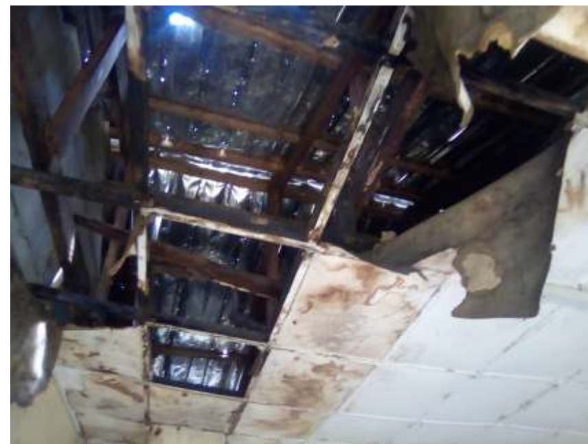
Government Junior Secondary School, Randa, Sanga LGA. Classroom with broken ceiling.