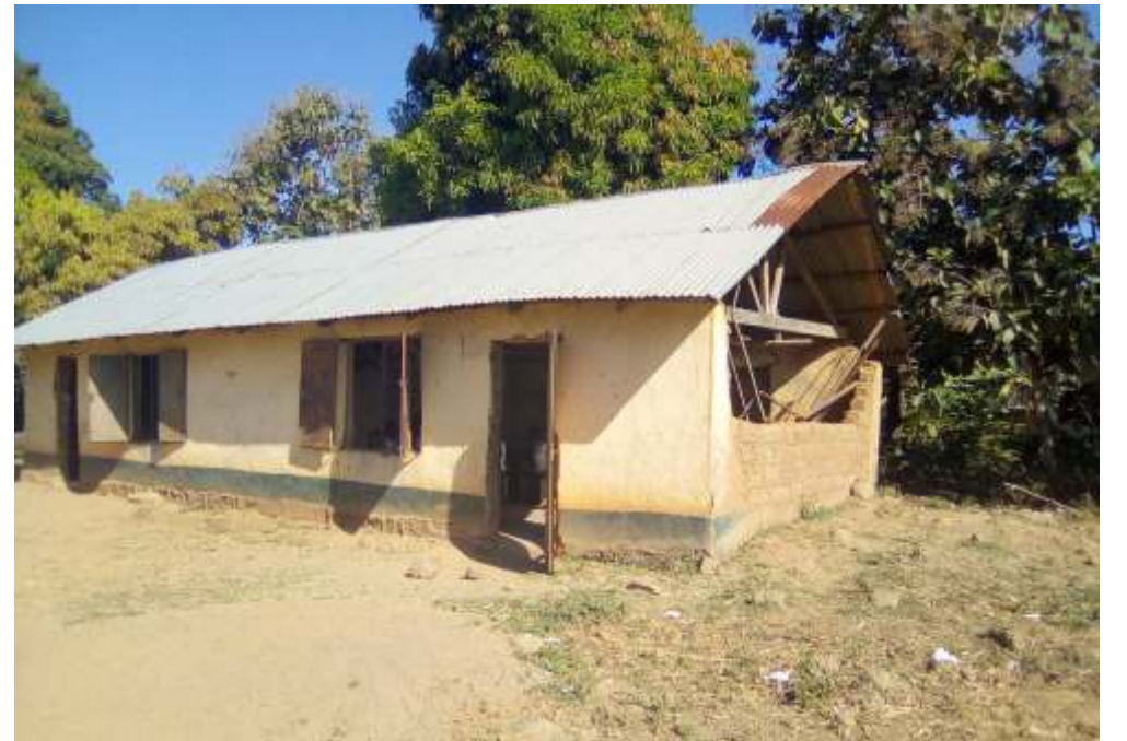
LGEA Primary School, Unguwan Gajere, Sanga LGA. The wall of the classroom has fallen.