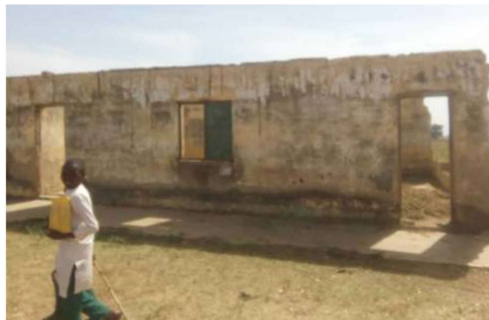
LGEA Primary School, Makera, Ikara LGA. The roof of the block of classrooms blown off by wind.