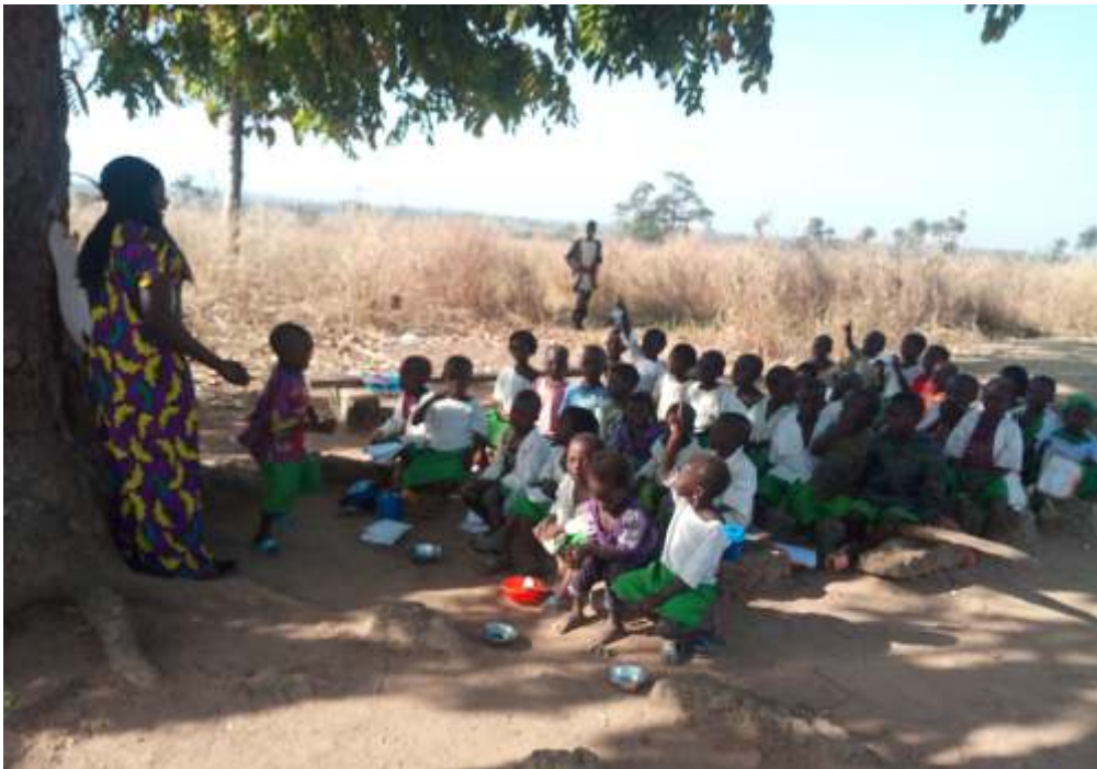
LGEA Primary School, Ningon, Sanga LGA. Pupils learn under a tree.