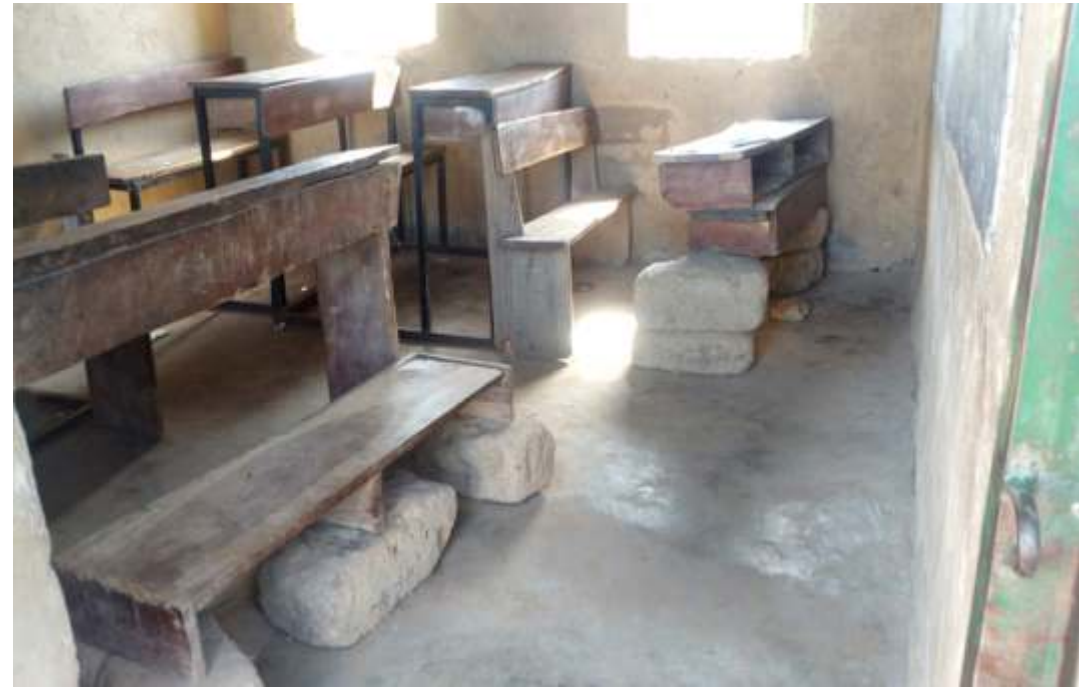
UBE Primary School, Akwa. Classroom setting with makeshift seats for pupils.