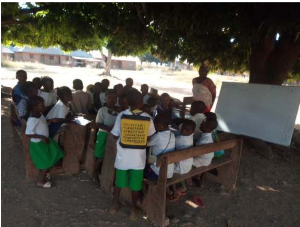
LGEA Primary School, Nandu B, Sanga LGA. Pupils learning under the tree.