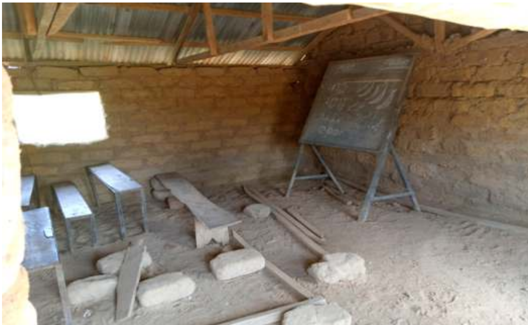
UBE Primary School Unguwar Doka. Classroom with makeshift seats for pupils.