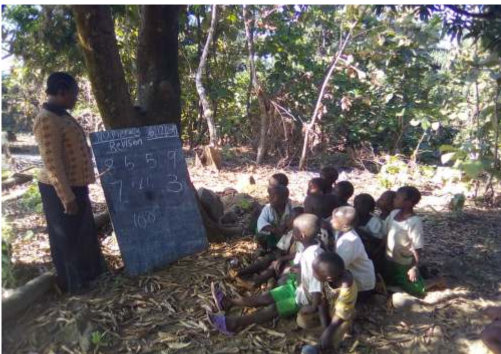
LGEA Primary School, Unguwan Gajere, Sanga LGA. Pupils learn under a tree.