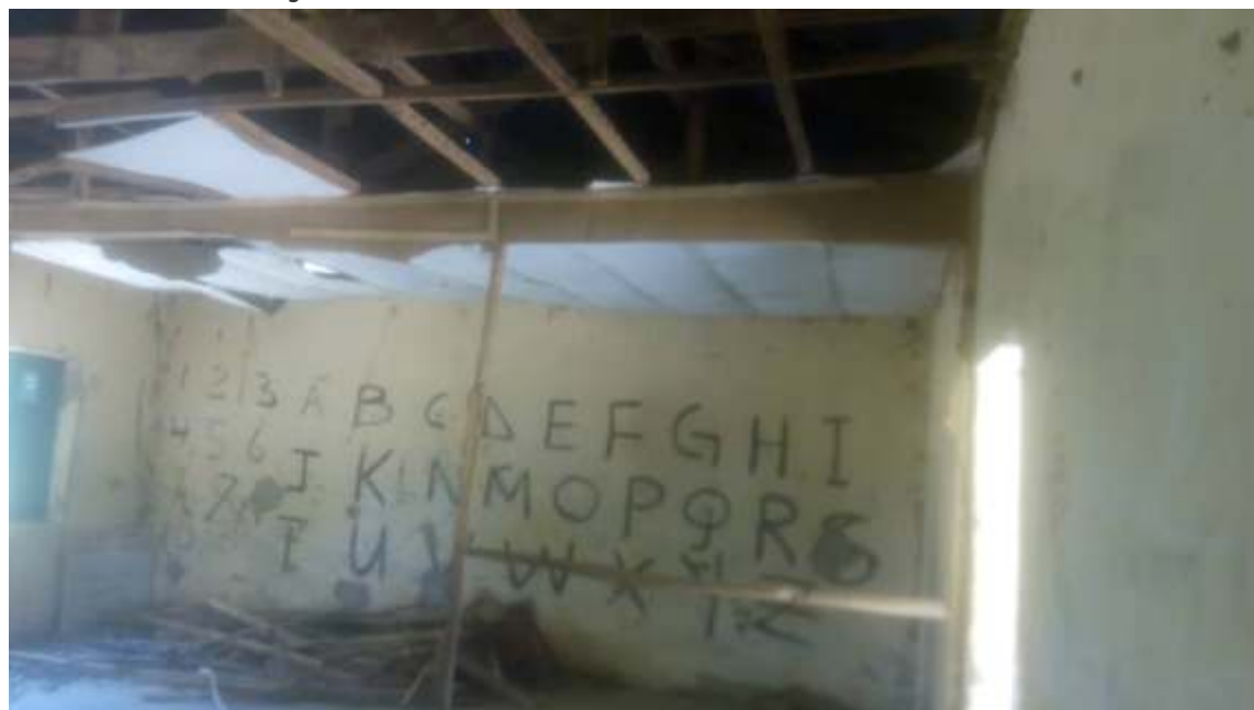
LGEA Primary School, Anguwar Ibrahim, Sanga LGA. Classroom with the ceiling and roof crumbling