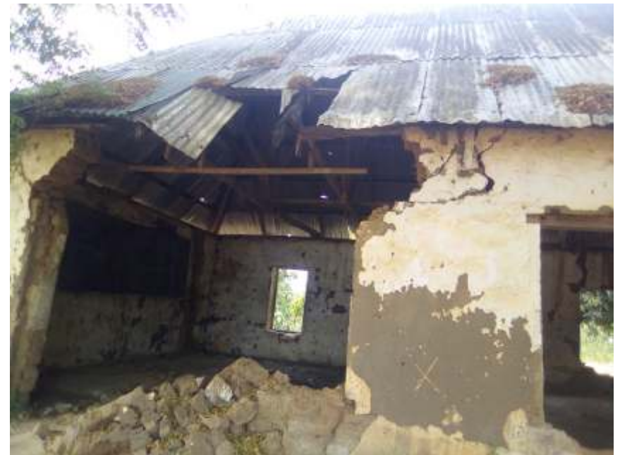
Government Junior Secondary School, Randa, Sanga LGA. Dilapidated and abandoned block of classrooms