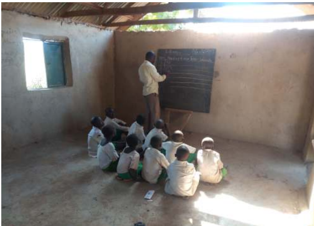
UBE Primary school, Gajere, Sanga LGA. Pupils sit on the floor to learn due to non-availability of tables and chairs.