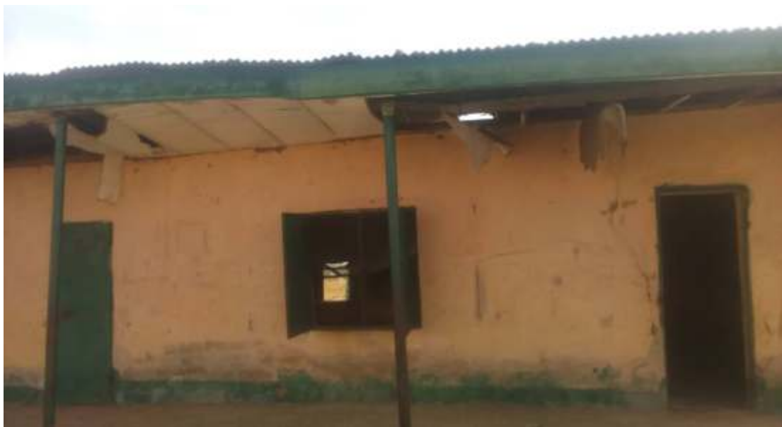
LGEA Primary School, Anguwar Halliru, Ikara LGA. The veranda ceiling board is dilapidated.