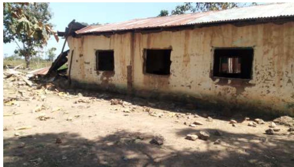
Government Secondary School, Gbonkpok, Arak, Sanga LGA. A dilapidated block of classrooms with broken windows and falling wall.