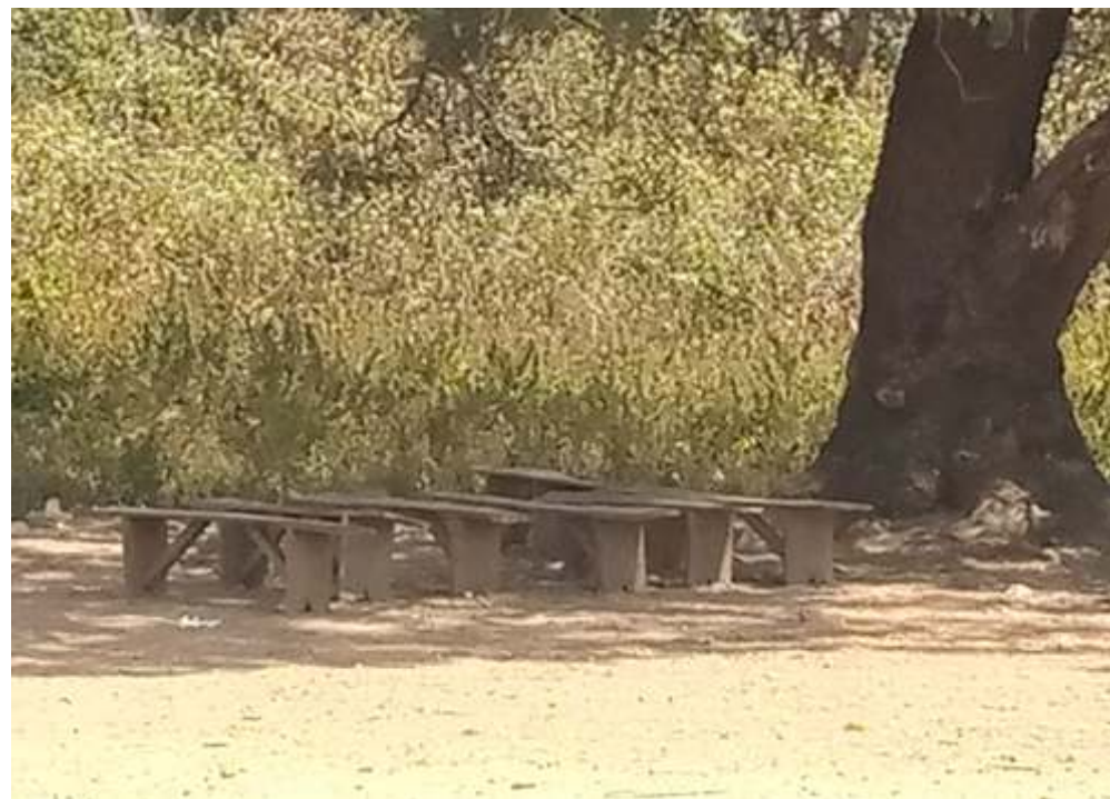
LGEA Primary School, Unguwar Jirgi, Sanga LGA. Classroom under a tree.