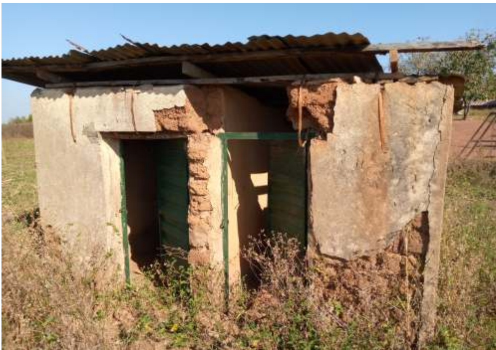
UBE Primary School, Mohanga, Fadan Karshi, Sanga LGA. The only toilet in the school. It is abandoned. Pupils resort to open defecation.