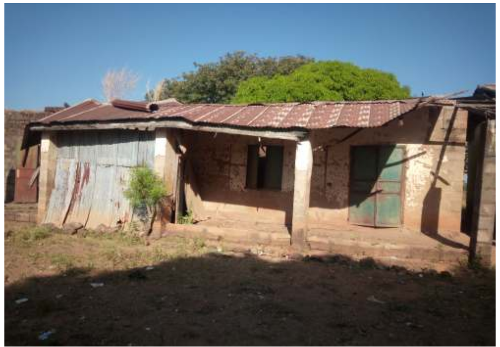
LGEA Primary School, Nandu B, Sanga LGA. A dilapidated block of classrooms.