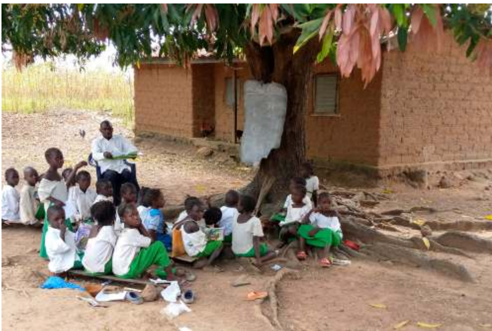
UBE Primary School, Ankirin, Sanga LGA. Pupils learn under a tree.