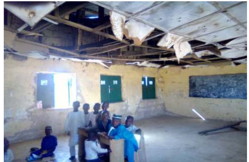
LGEA Primary School, Anguwar Mudi, Ikara LGA. The classroom's ceiling board is dilapidated.