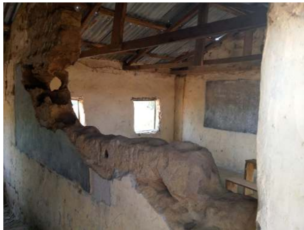
LGEA Primary School, Unguwan Makama, Sanga LGA. A dilapidated classroom.