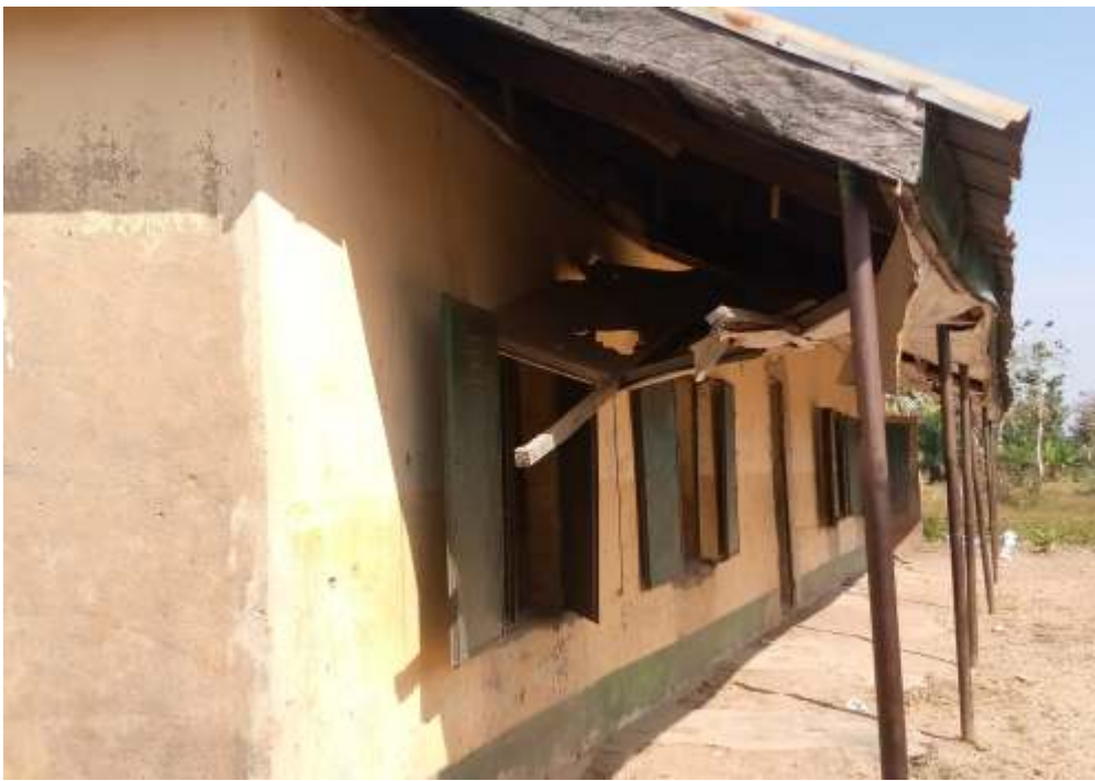
LGEA Primary School, Tsauni Kulere, Sanga LGA. The ceiling of the classroom is crumbling.