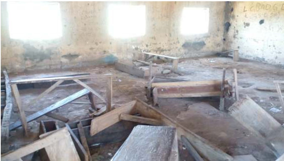
Government Secondary School, Gbonkpok, Arak, Sanga LGA. Dilapidated and abandoned reading furniture.